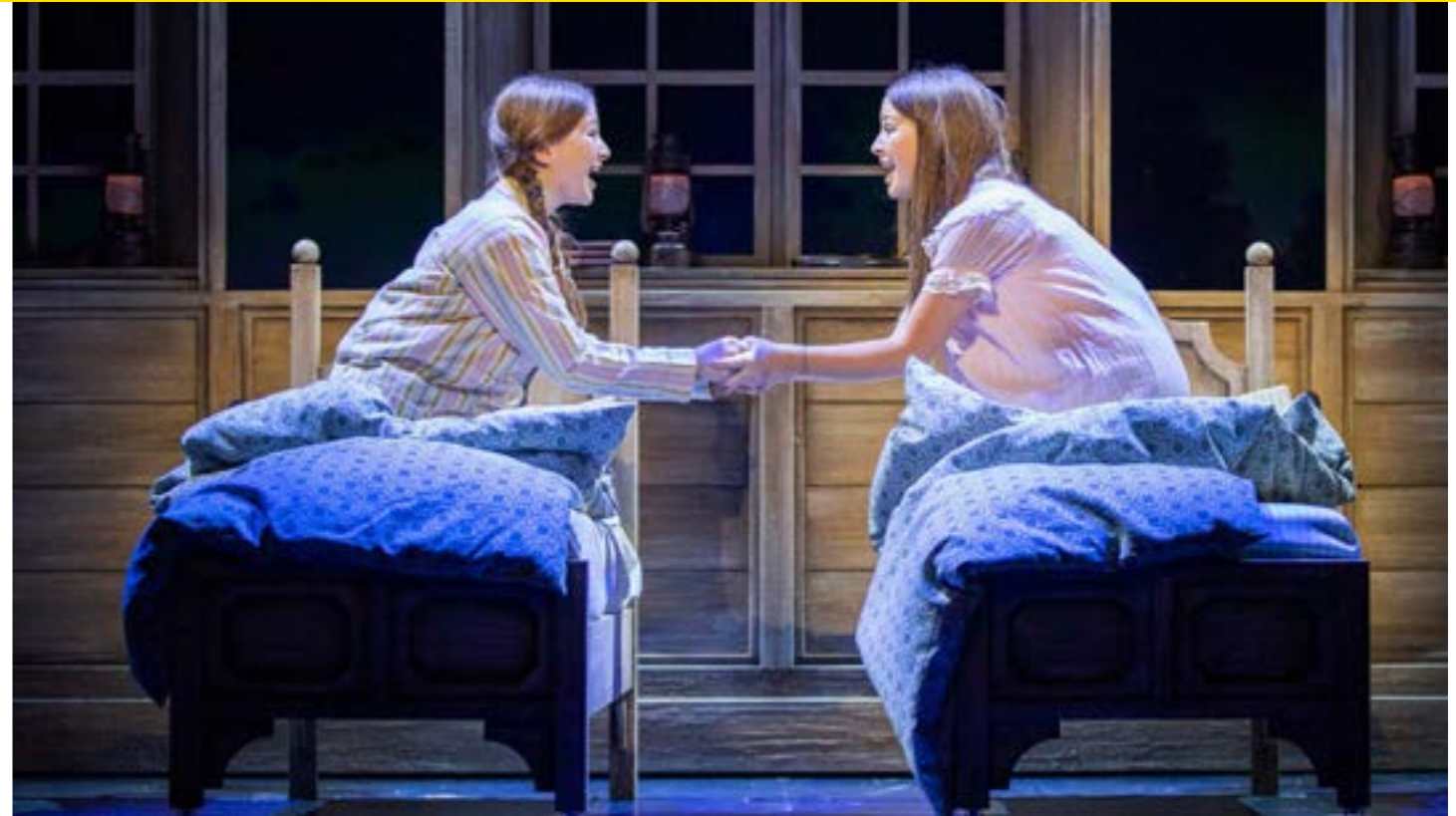
Nottingham Playhouse Theatre Company and Kenny Wax Ltd IDENTICAL

based on the novel by Erich Kästner Tue 26 Jul – Sun 14 Aug 2022