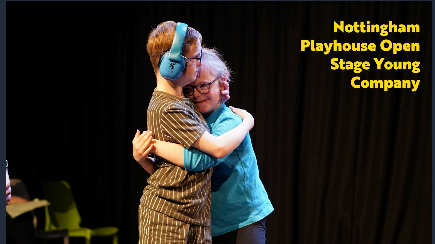
Nottingham Playhouse Open Stage Young Company

In 2023, Nottingham Playhouse engaged with 40,000 people through 61 community projects across Nottingham and Nottinghamshire.