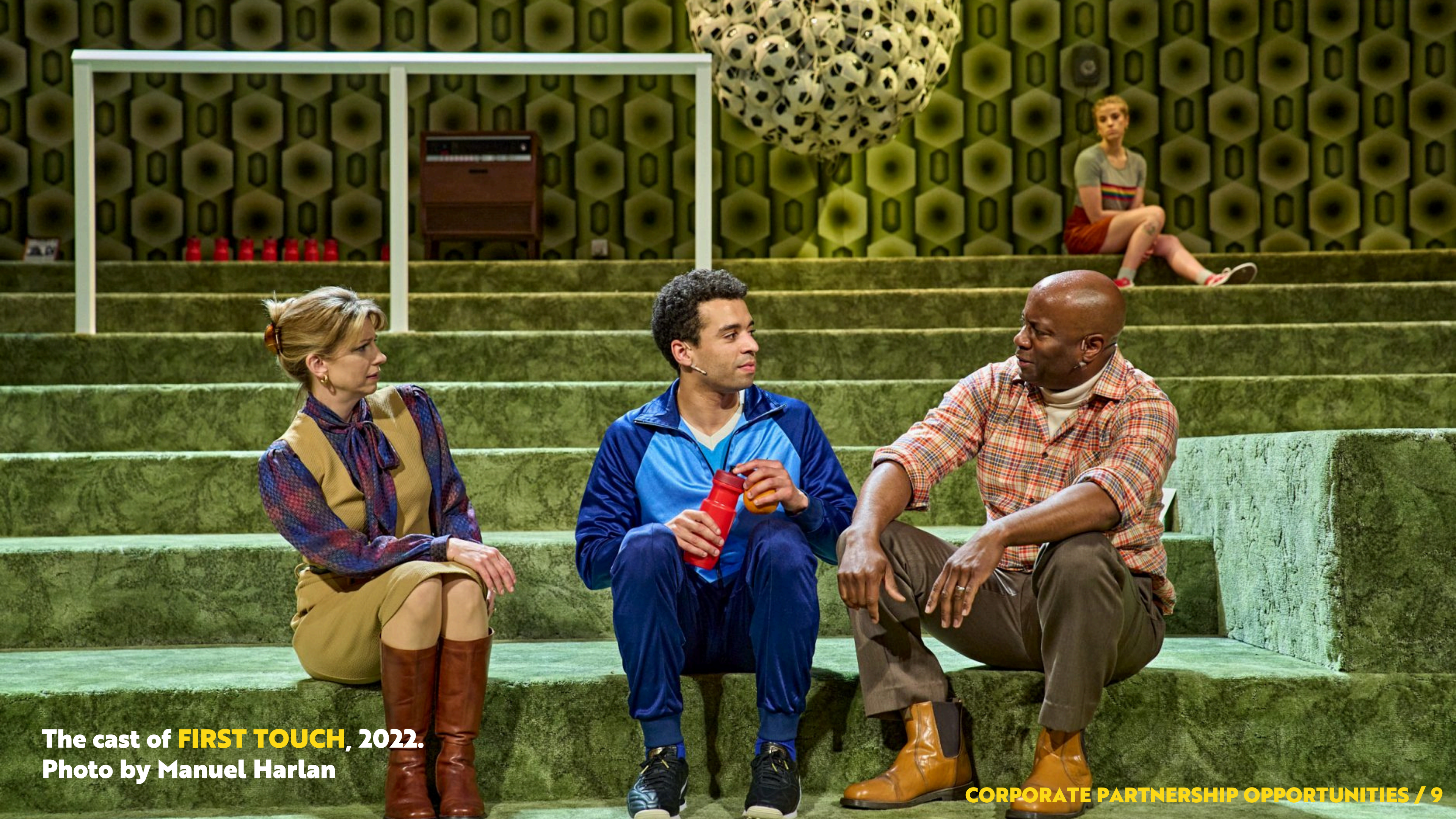
The cast of FIRST TOUCH , 2022.