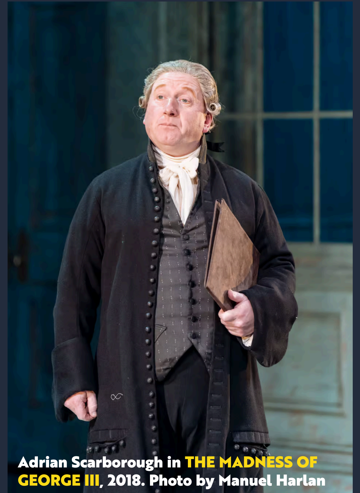
Adrian Scarborough in THE MADNESS OF GEORGE III, 2018.