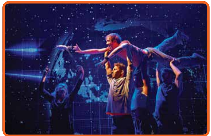
The Curious Incident of the Dog in the Night-Time